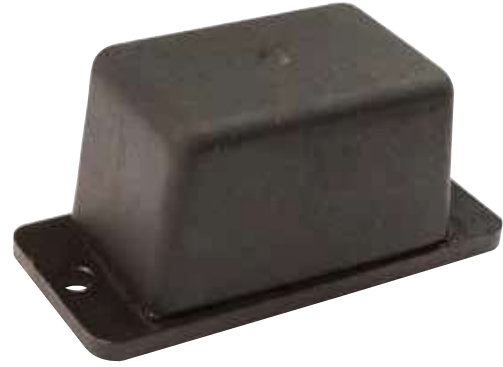
Plate buffers provide a Heavy Duty solution for absorbing high levels of shock and impact forces. The large rubber section allows for high levels of deformation, ensuring that the impact energy is dissipated effectively.